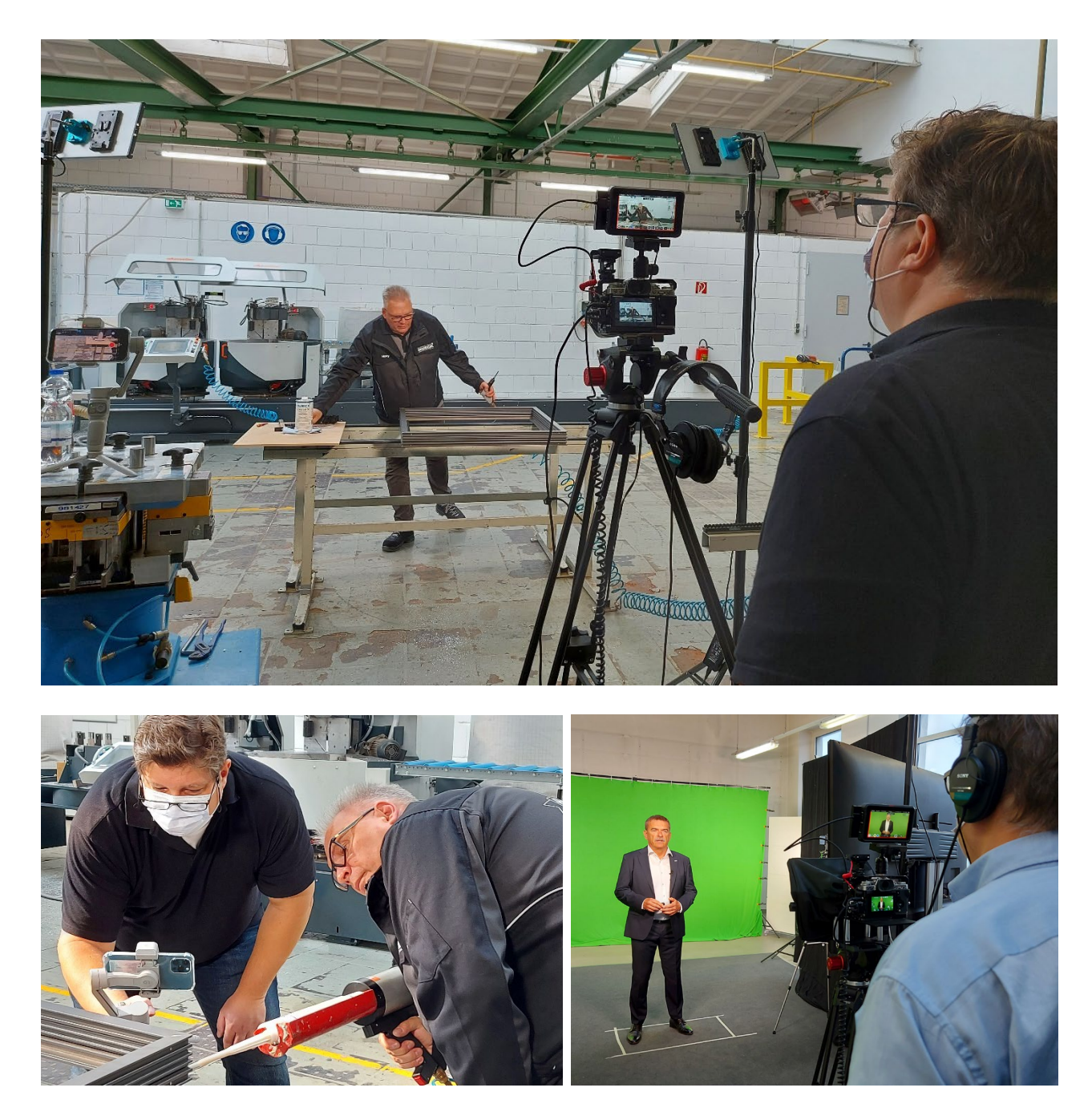
Images 3, 4, 5: Impressions of the film shooting in the HUECK workshop and film studio