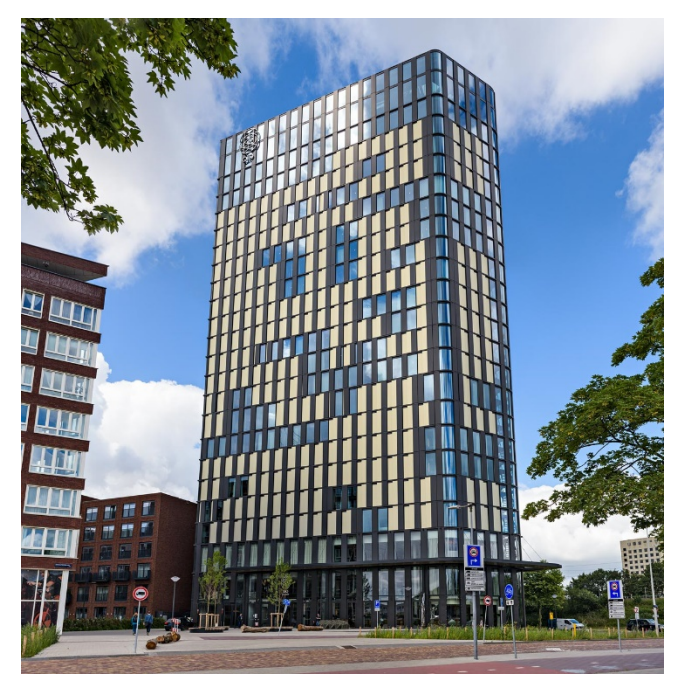
Figure 2: Thanks to the use of aluminum in the facade, the QO Hotel in Amsterdam was honored with the LEED Platinum certification.

The monitoring of the ecological balance of the profile systems is in line with the sustainability focus of the German aluminum system house. This was defined in the Green Balance as one of the three action fields within the HUECK World Life Balance. The aim is a balanced equilibrium between environmentally conscious, economic and social aspects, which are reflected in the Cradle to Cradle certification catalog. The awareness of the scarce availability of resources and the responsible use of them is anchored in the company's longstanding tradition. Holistic planning is the prerequisite for long-term ecological and economic success. With the Cradle to Cradle certification, architects, investors and builders have an additional opportunity to meet the complex requirements of modern, sustainable and intelligently planned buildings.