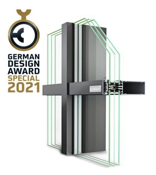
impact is recorded in Environmental Product Figure 3: HUECK Trigon FS received the German Design Award for its excellent product design.

HUECK uses the results of the regular checks of the ecological footprint within the HUECK World Life Balance to continuously improve the quality of the system solutions. Constant further development and improvement where it makes sense and is beneficial is a tried and tested basic attitude that has been pointing the way for the entire organization for decades.