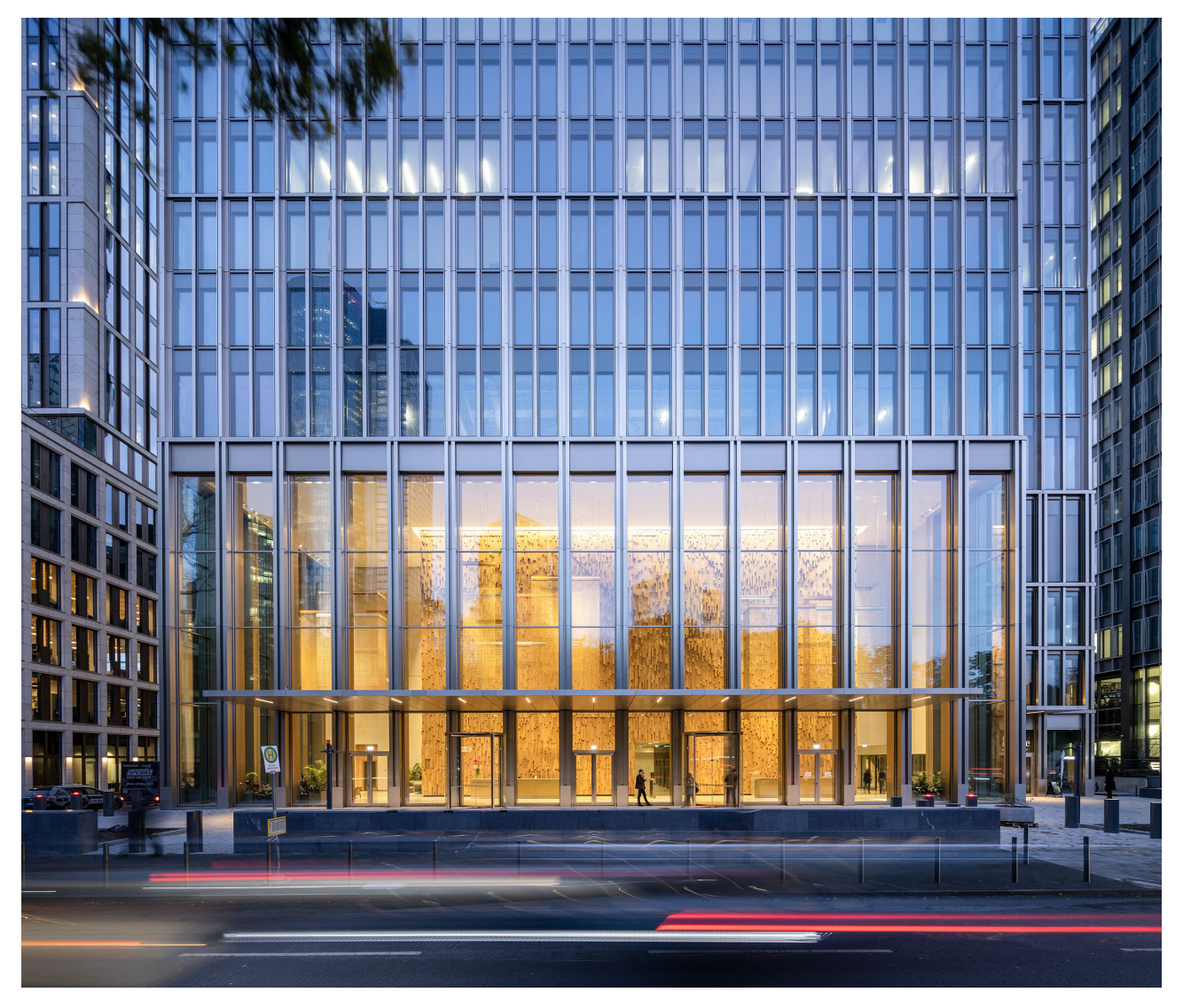
Figure 3: The concise, vertically structured window facade made of glass and anodized aluminium of the four-story high entrance area was implemented with a mullion-transom facade from the HUECK Trigon 60 series.

product family are EPD and Cradle to Cradle certified. Further sustainable measures at HUECK can be found at: <u>www.world-life-balance.com</u>.