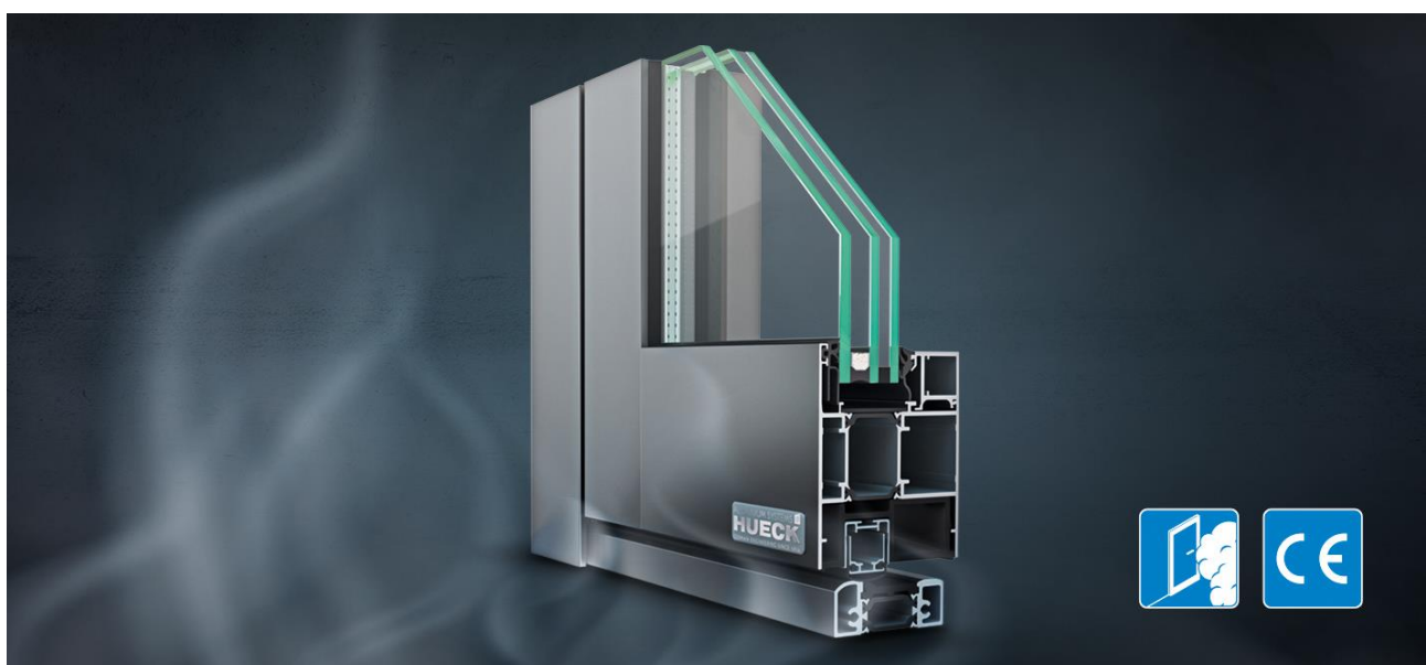
Figure 1: HUECK Lava 77-S CE external smoke protection door

Sources: ift Rosenheim GmbH (2020), TÜV Rheinland AG (2020)